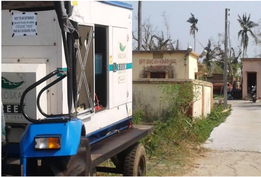
Generator mounted in Puri District by IREL, during devastation of Cyclone Fani.